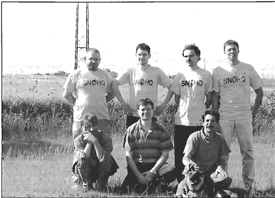
The 20-meter SSB team: (l to r in back) SQ2BZW, SP2BZW (father of SQ2BZW), SO0WDX (US5WDX), SP4ZO; (l to r in front): SQ2CFB, DJØIF (SP8RX), SP2FAX.

else failed, we'd go back to individual logs like we had done in previous years.